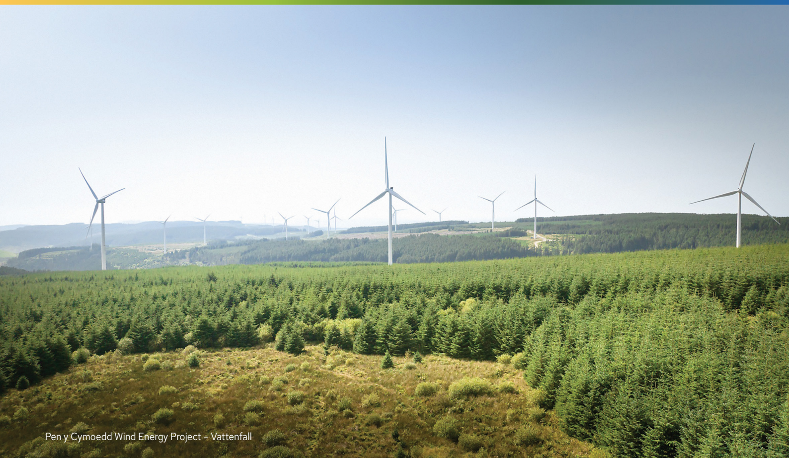
Pen y Cymoedd Wind Energy Project – Vattenfall

This will be a priority for Trydan. It is also important to showcase the great work of communities in influencing and managing community funding to deliver more positive impacts in their local areas.